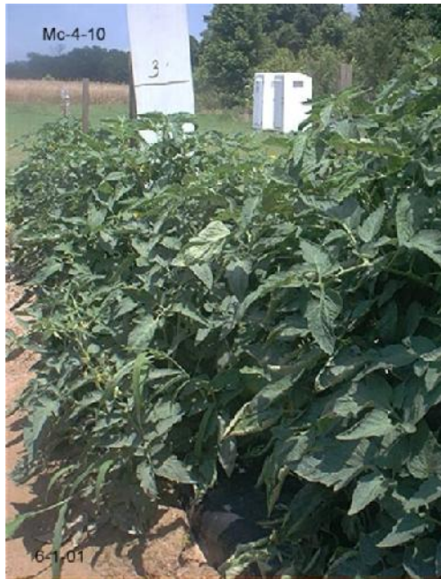
Untreated Tomatoes – 33” high ↓