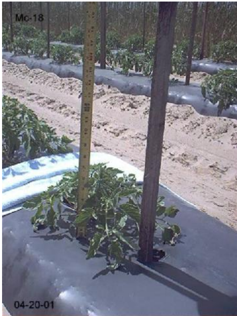
Untreated tomato plant, 6 wks, 7" high

Take a look at the photos below. You will notice the plants grow faster, thicker and with much better root development. The flowering and tomato output is up to double that of untreated plants with larger better tasting fruit!