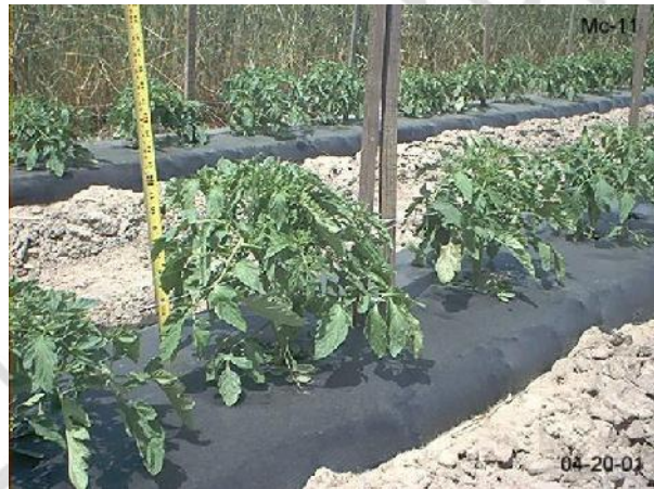
Vee-Go Treated tomato plant, 6 wks, 12" high